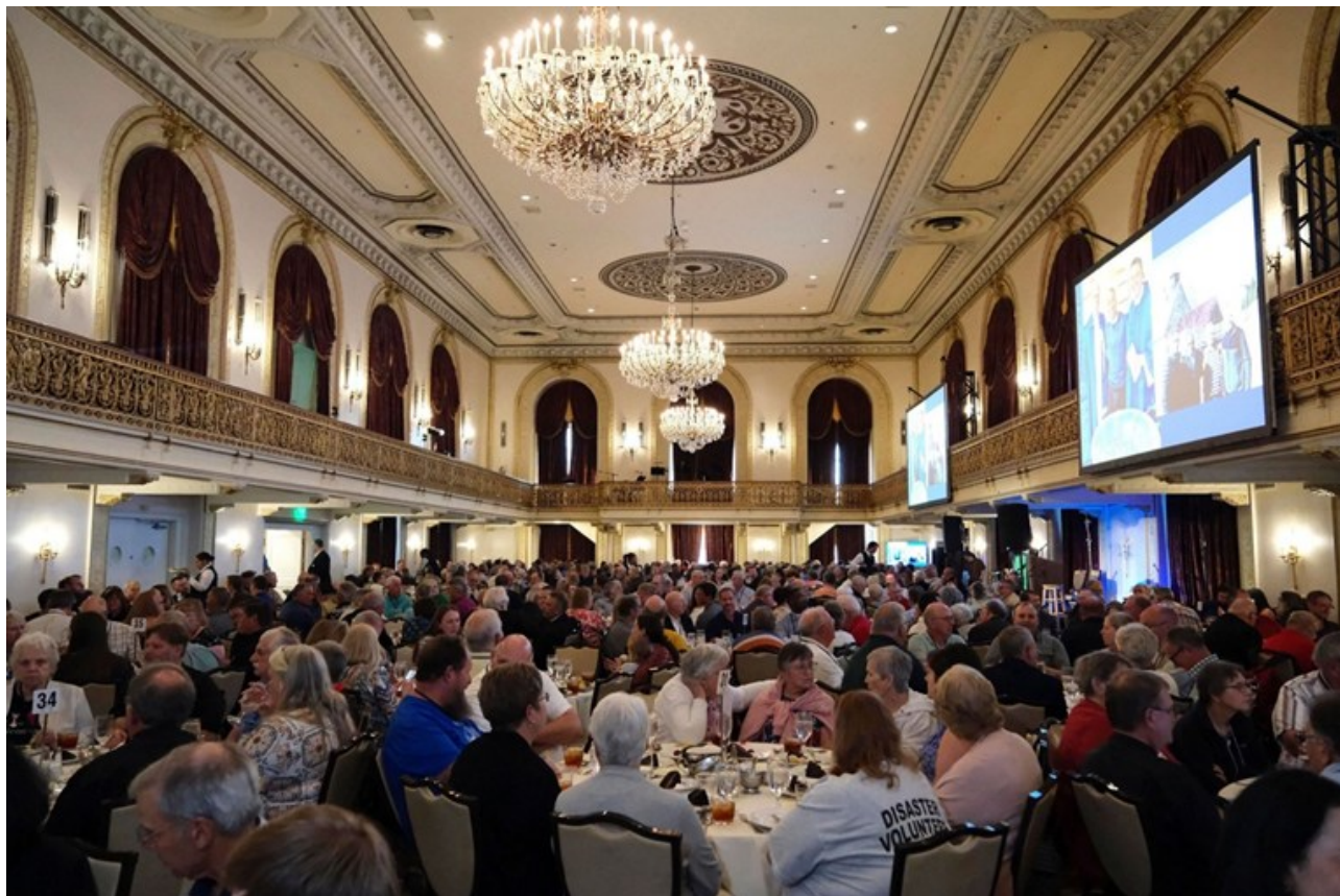
(The view from our delegates' table.)