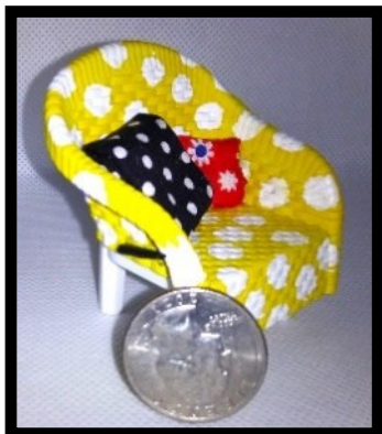
It's an Itsy Bitsy Teeny Weeny Yellow Polka Dot Recliner

Grove City, Ohio November 15, 2025 – Sofas that fit in the palm of your hand, fine China the size of your thumb nail, lamps smaller than marbles that light up, six-inch-long row boats that really float, the list is as endless as it is amazing. Come see all the itsy bitsy teeny weeny miniature fine art and collectibles you've been missing!