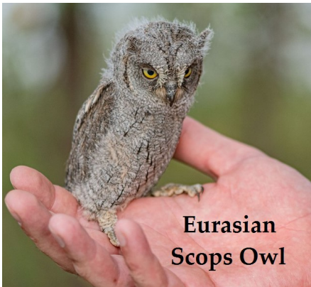
Eurasian Scops Owl